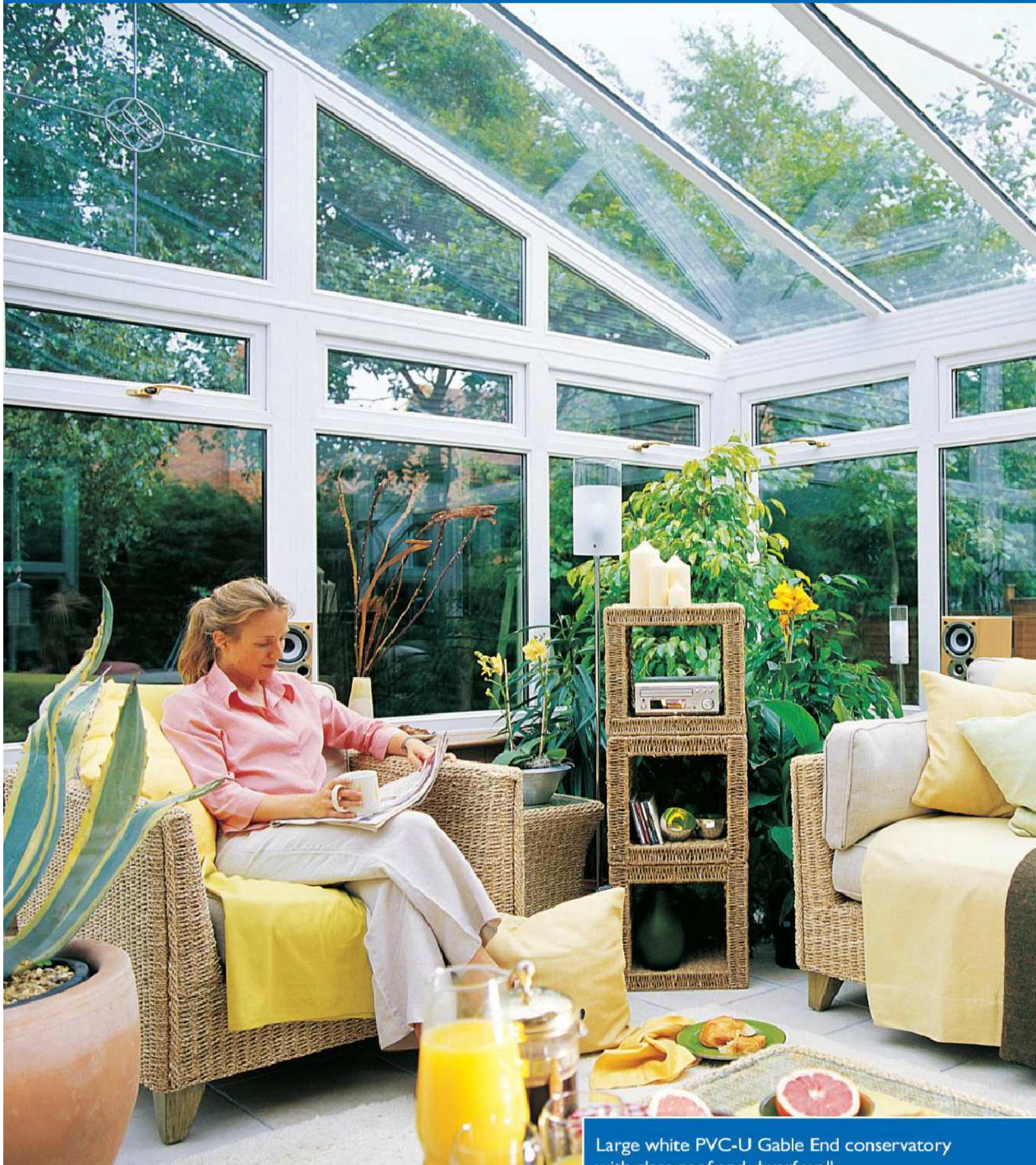
Large white PVC-U Gable End conservatory with slatted front door and full