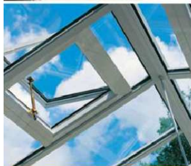
Roof vent: manual or electric options available

You may find that traditional French doors match the tone of your home - but don't forget that you have the option of a wide range of patio doors and single doors.