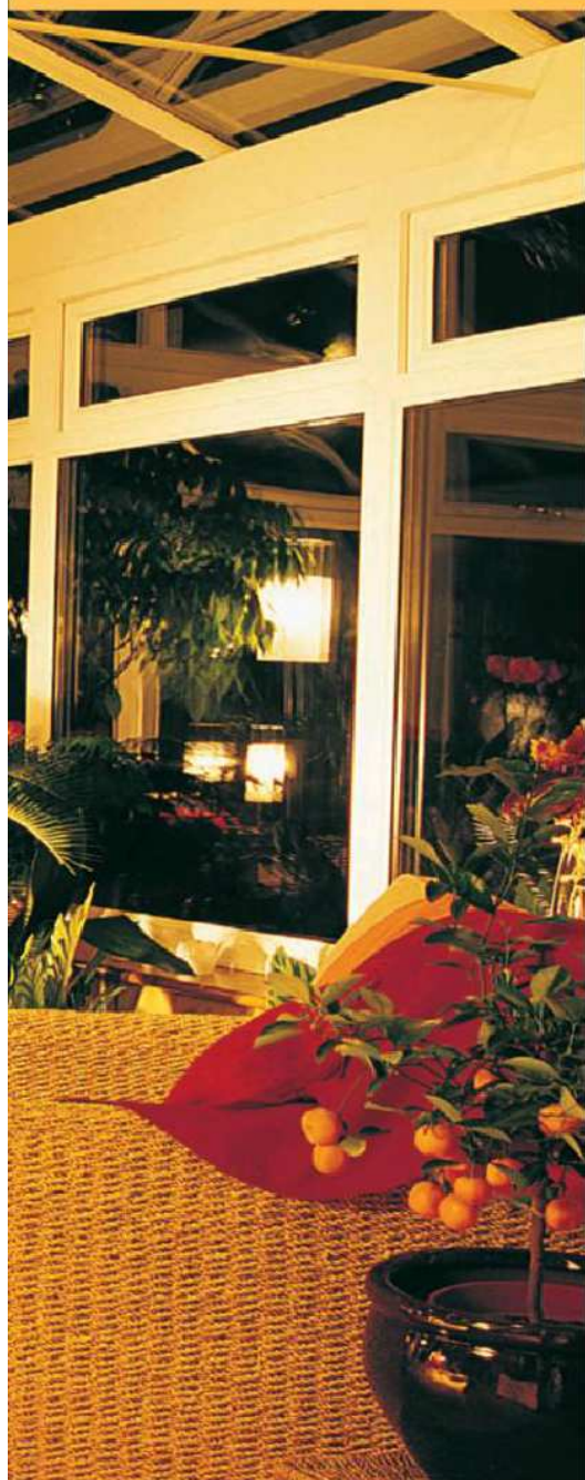
White PVC-U Victorian conservatory on large property with Georgian bar feature glass and rendered dwarf wall.