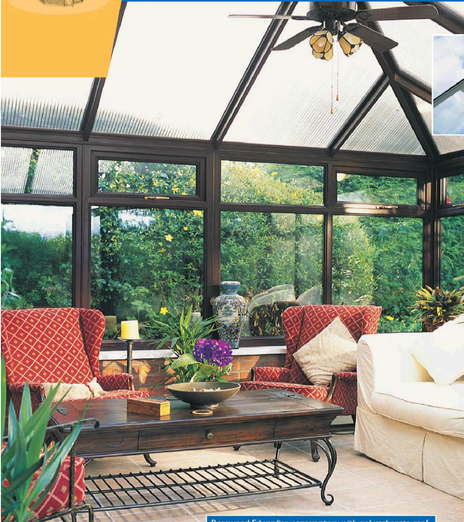
Recessed Edwardian conservatory with polycarbonate roof