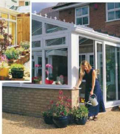
Rosewood Edwardian conservatory on a mock tudor home with a polycarbonate roof, French doors and matching brick dwarf walls.